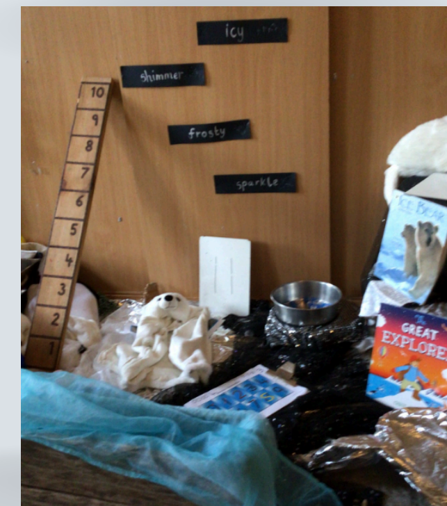
Imaginative Role- Play- vocab displayed at child height