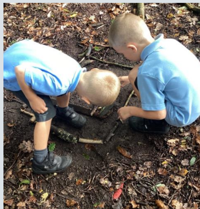
WellComm Targets practised in Forest School