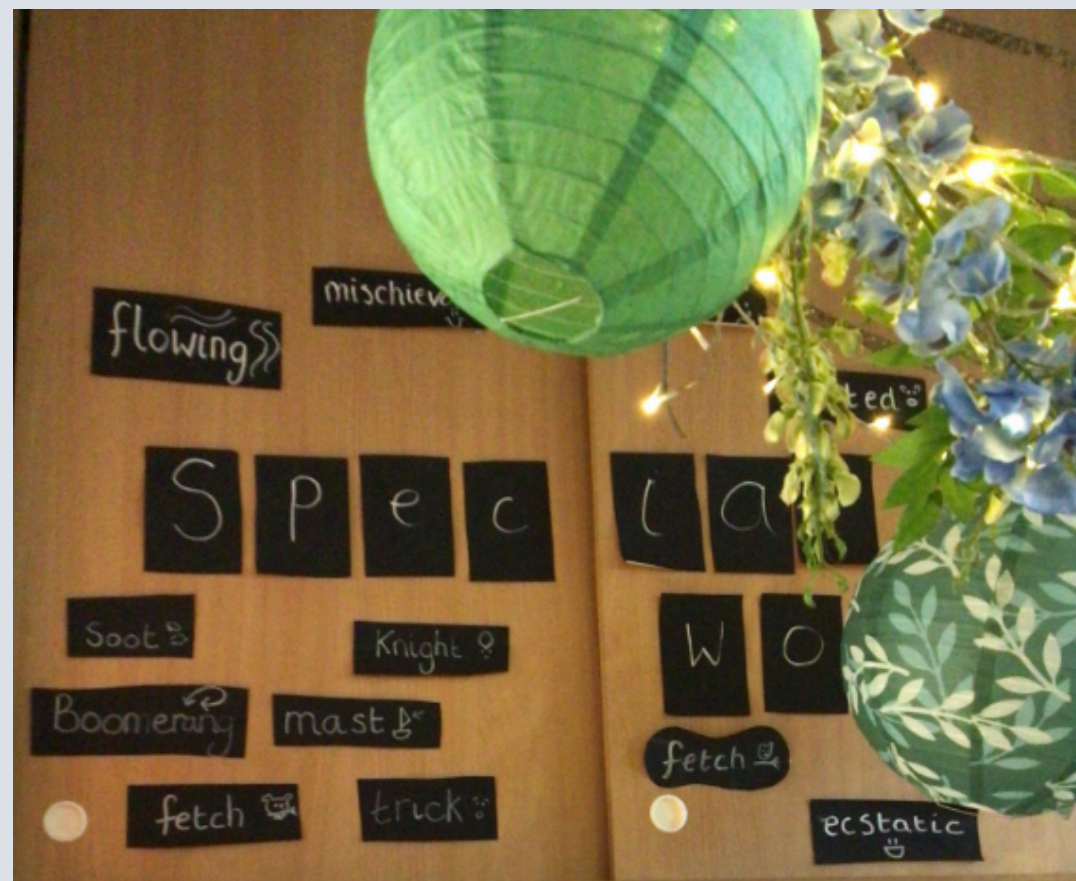
Special Words Tree and words displayed to support adult in setting