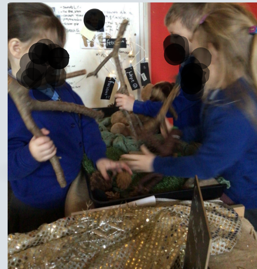
Sparkly Special Words Tree within Provision