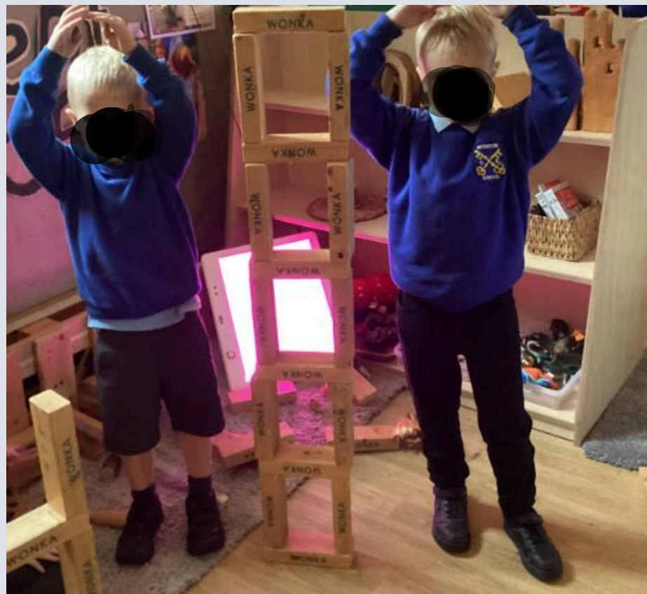
Practising actions within provision to learn special words