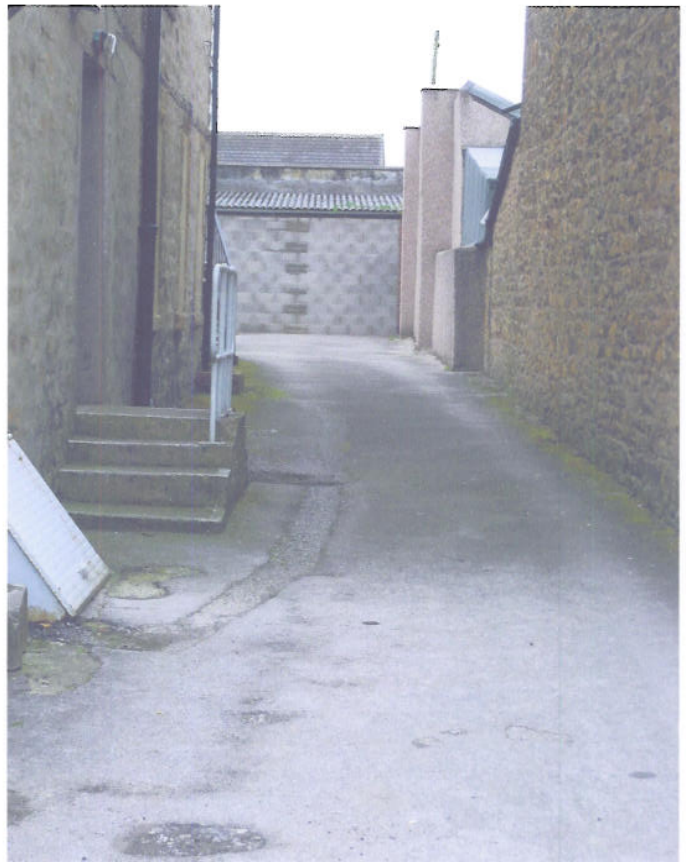
DRIVEWAY AT THE SIDE OF MELBOURNE