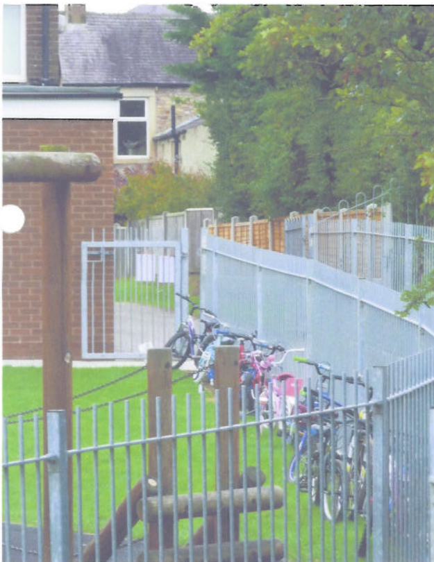
PLEASE NOTE GATE STRAIGHT INTO THE SCHOOL YARD