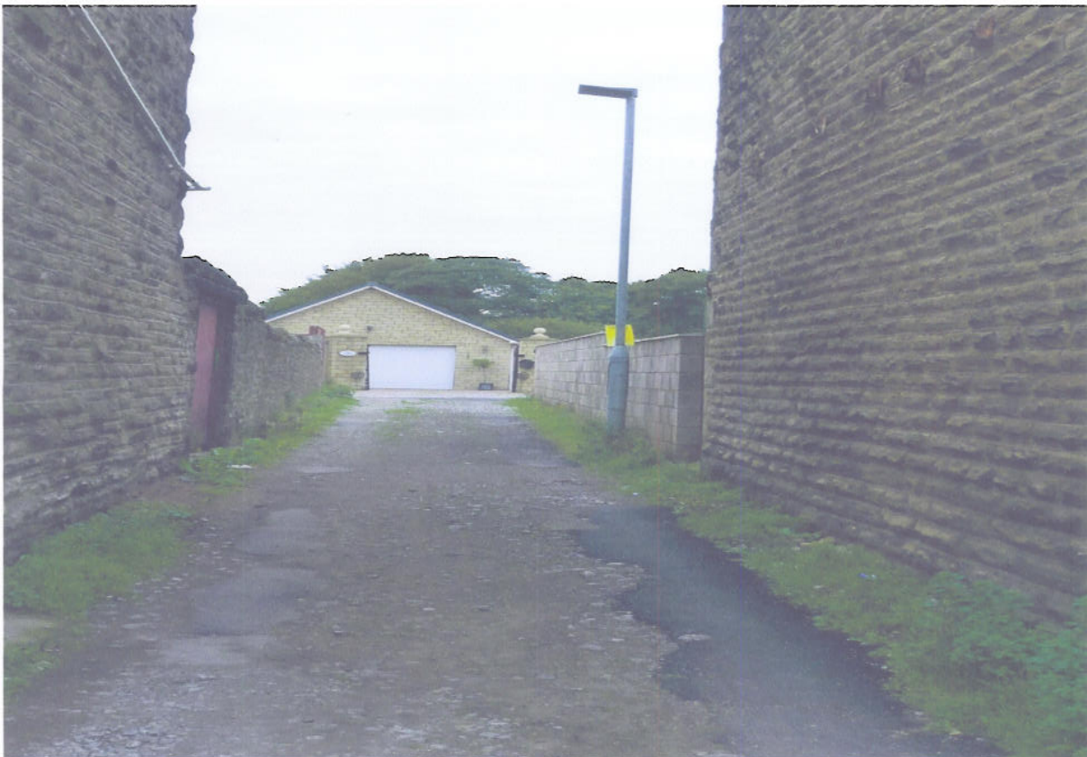
2 ND ALLEY OFF VALE ROAD STREET LIGHT DOWN THE ALLEY