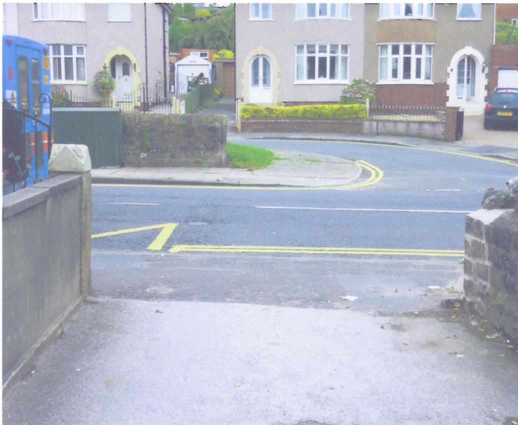
VIEW FROM MELBOURNE DRIVE WAY ONTO SLYNE ROAD