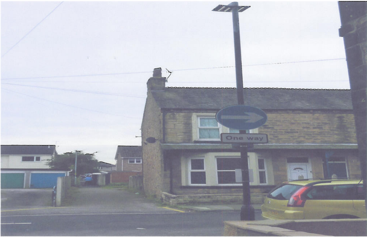
2 ND ALLEY OFF VALE ROAD STREET LIGHT ON CORNER