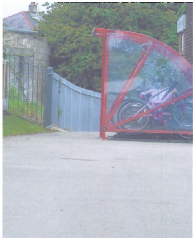
VIEW OF PATH FROM SLYNE ROAD