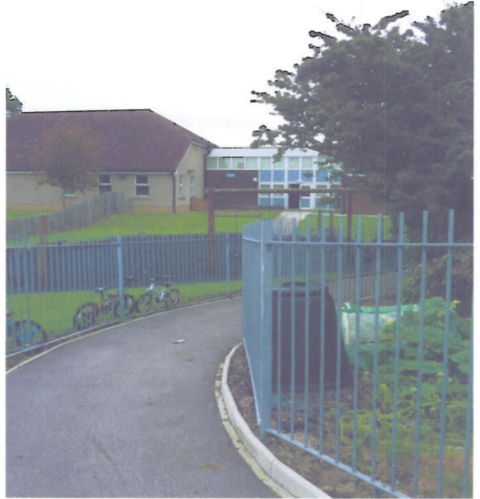
FOOTPATH OFF 2 ND ALLEY LEADING STRAIGHT TO THE SCHOOL. WHICH MEANS THAT THE CHILDREN DON'T EVEN HAVE TO GO ONTO THE MAIN ROAD.