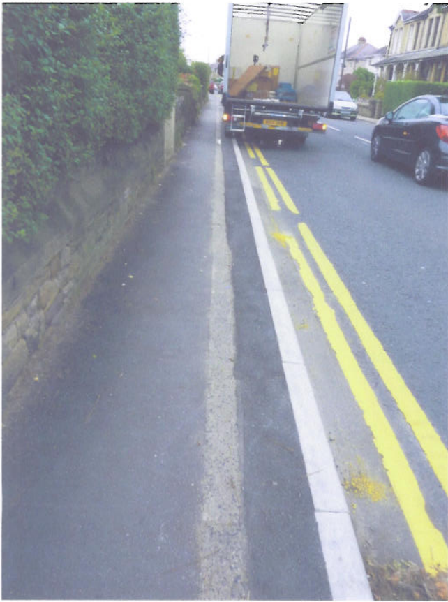
THE WIDENED FOOTPATH ON SLYNE ROAD