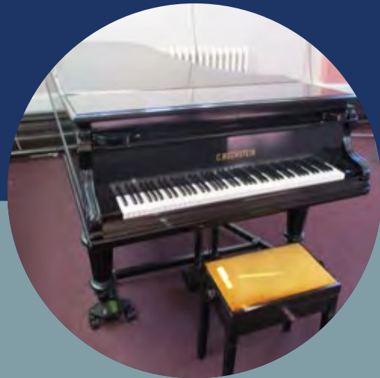
The piano in the Lecture Hall at Accrington Library

The other gem to bring to your attention, is the Bechstein grand piano at Accrington Library , which you will find in the Lecture Hall.