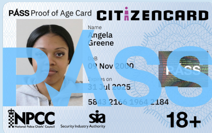
8 PASS logo revealed under UV light