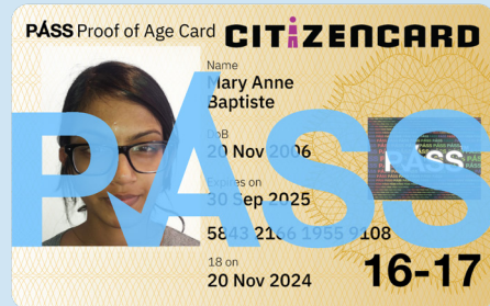
7 PASS logo revealed under UV light