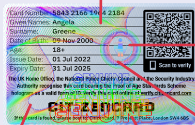
D. microtext, reads 'GENUINE-ISSUED BY CITIZENCARD' E. 'GENUINE' with wireframing effect