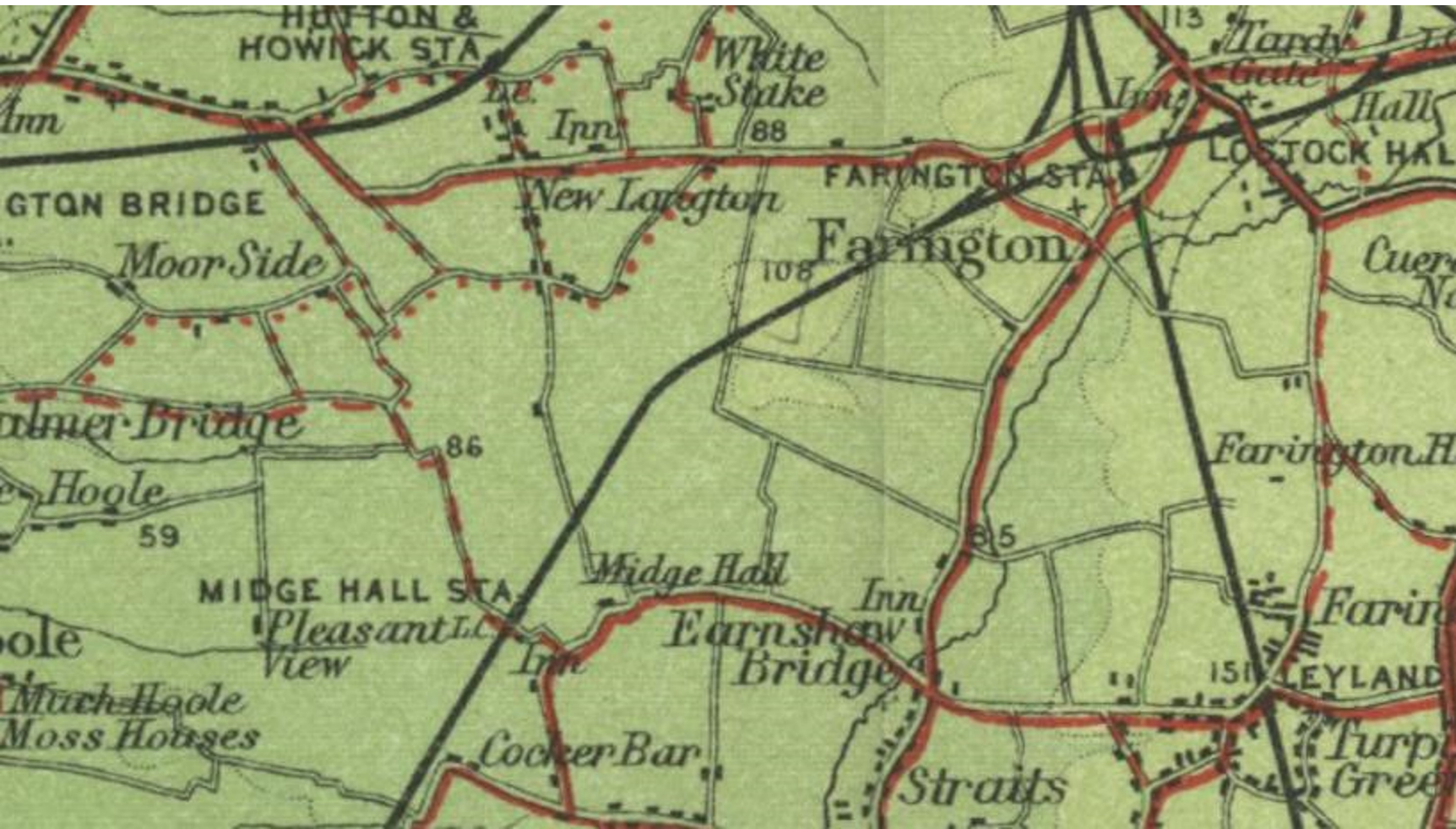
Extract from Bartholomew's Map published 1920