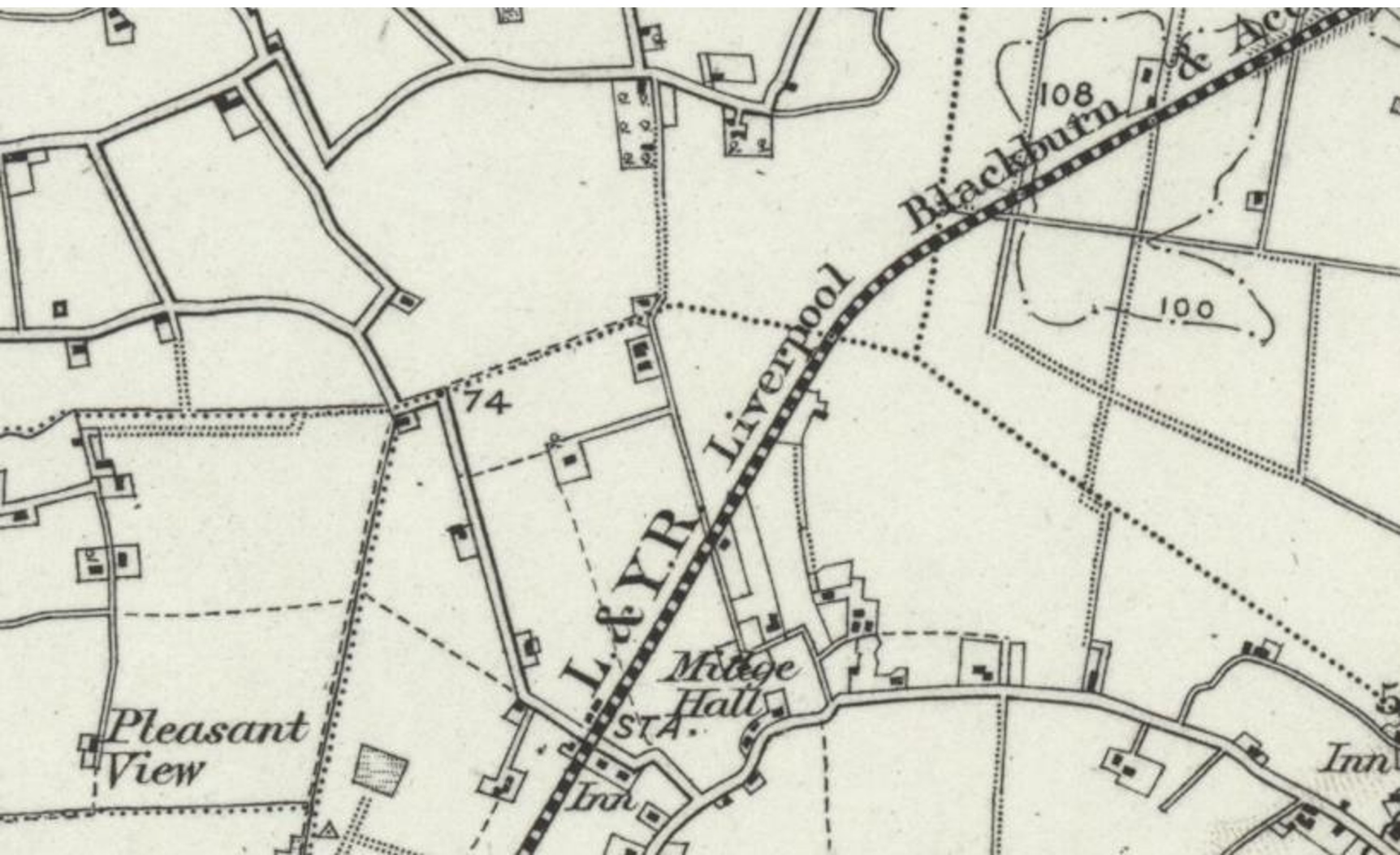
Extract from 1 inch OS Map Sheet 75 – Preston published 1896