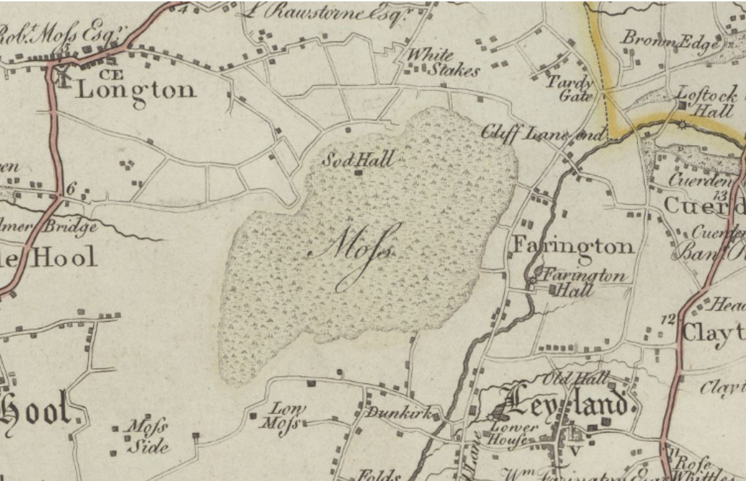
Extract of Yates' Map of Lancashire 1789 (not to scale)