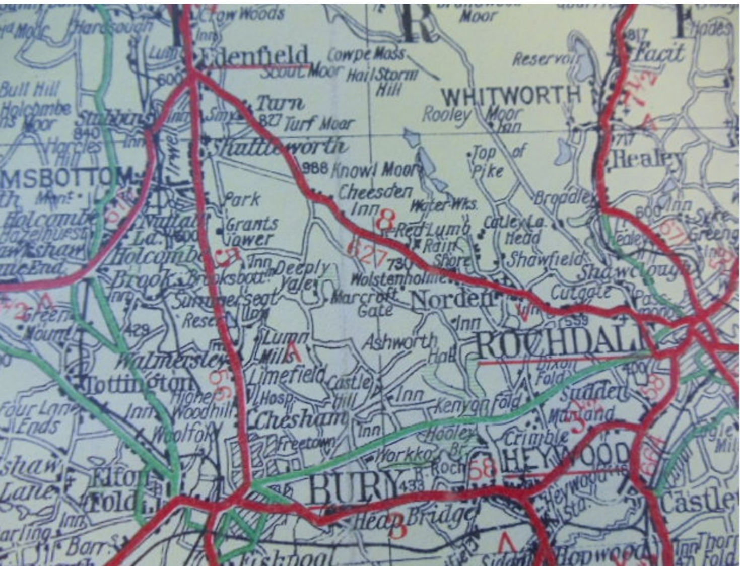
1/2 inch to the mile Geographia Road Map 30 miles around Manchester revised 1921