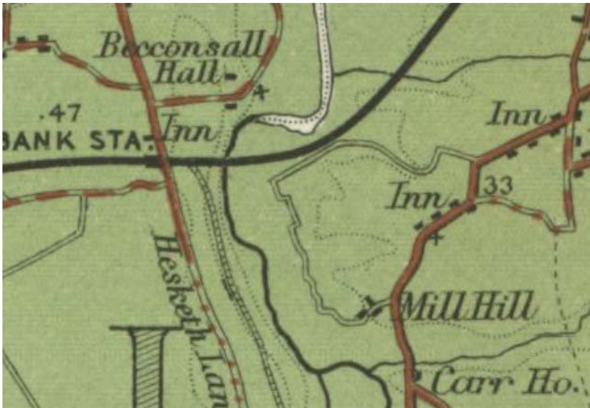
Extract from Bartholomew's 1/2 inch map Sheet 8 – Liverpool & Manchester published 1904 (not to scale) with key