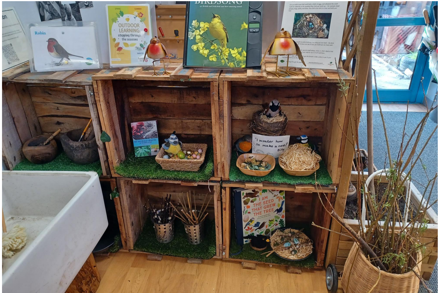
Outdoor kitchen – making bird nests