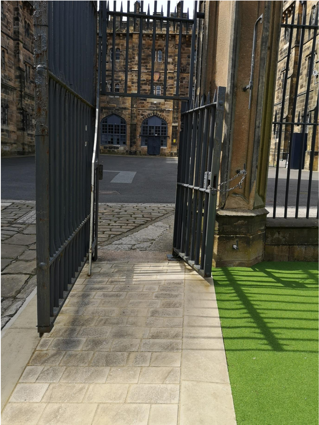
Entrance to the Upper Courtyard