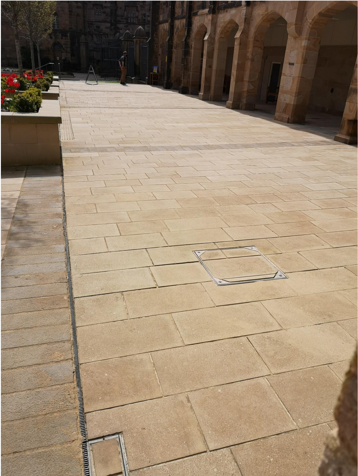
Ramp adjacent to the cloister and tour booking office