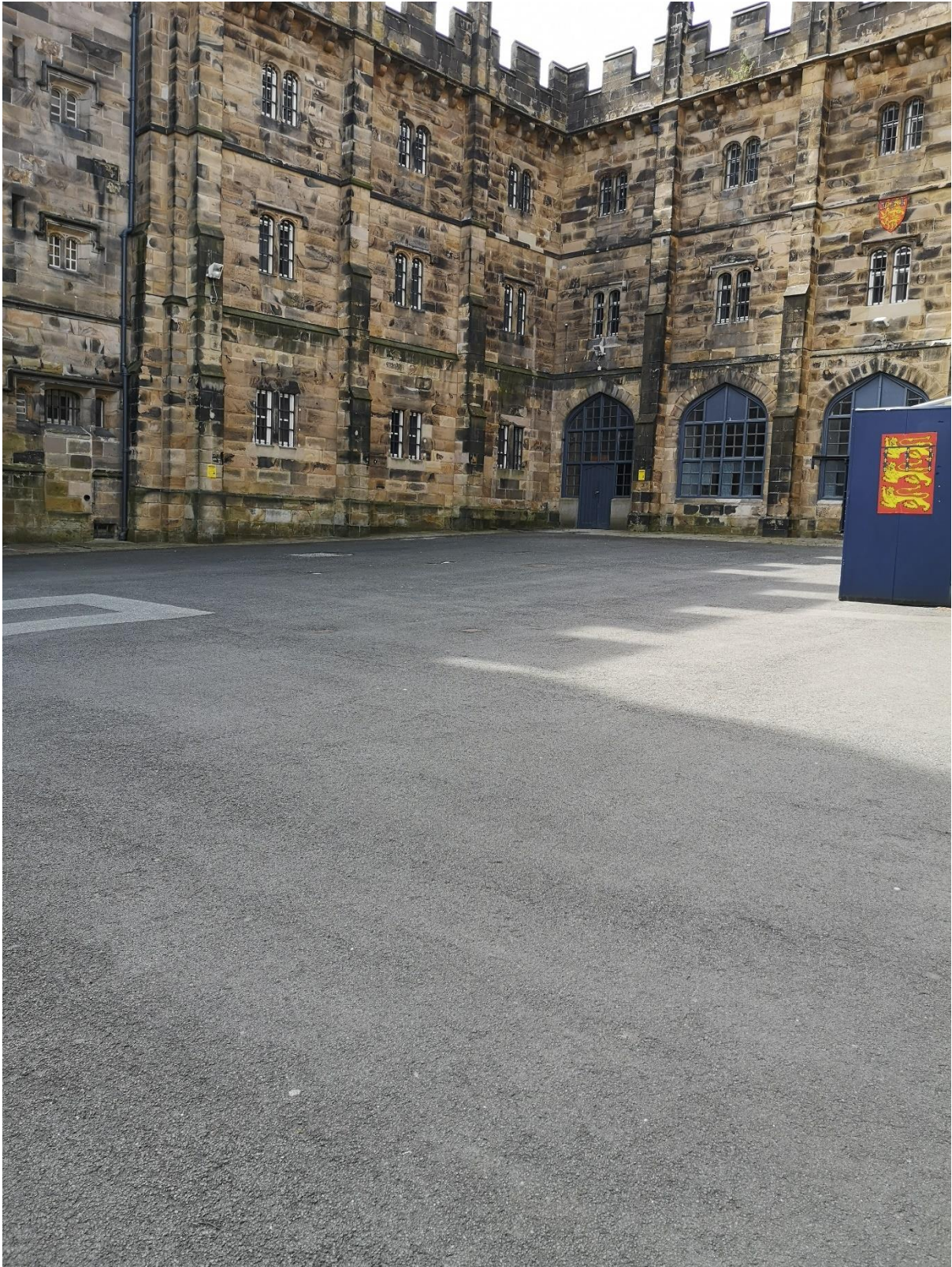
The Upper Courtyard