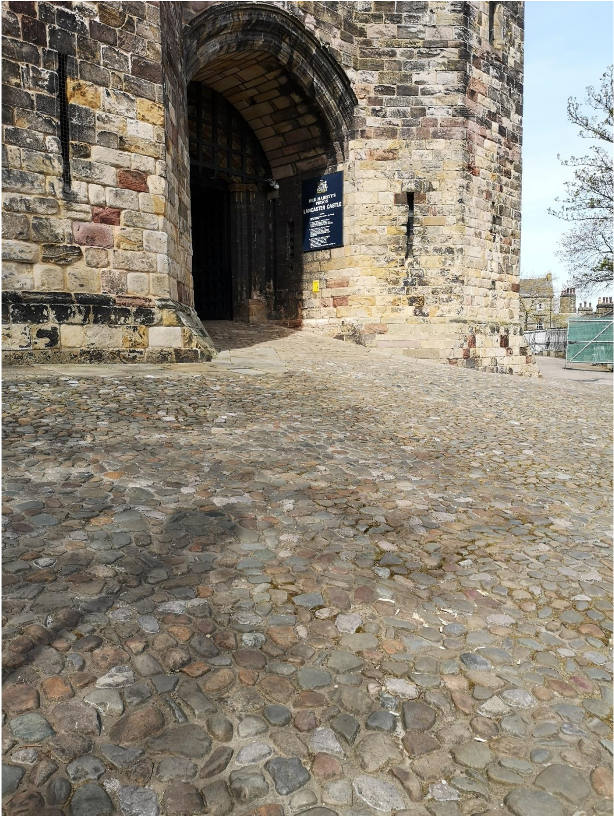
The Approach to the Gatehouse