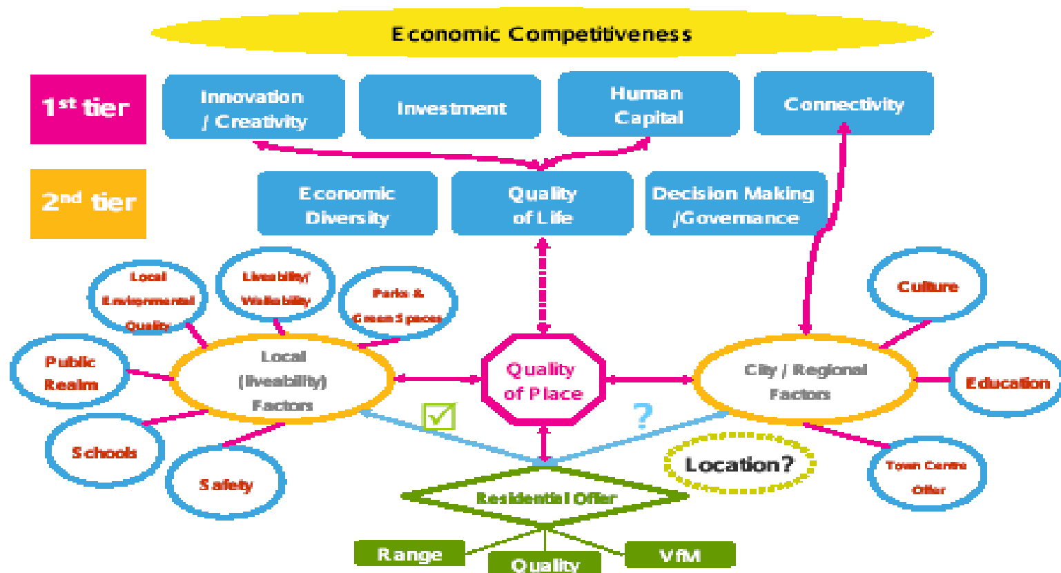
Figure 1-1: Residential Offer/Quality of Place & Economic Competitiveness

The Northern Way Sustainable Communities Team