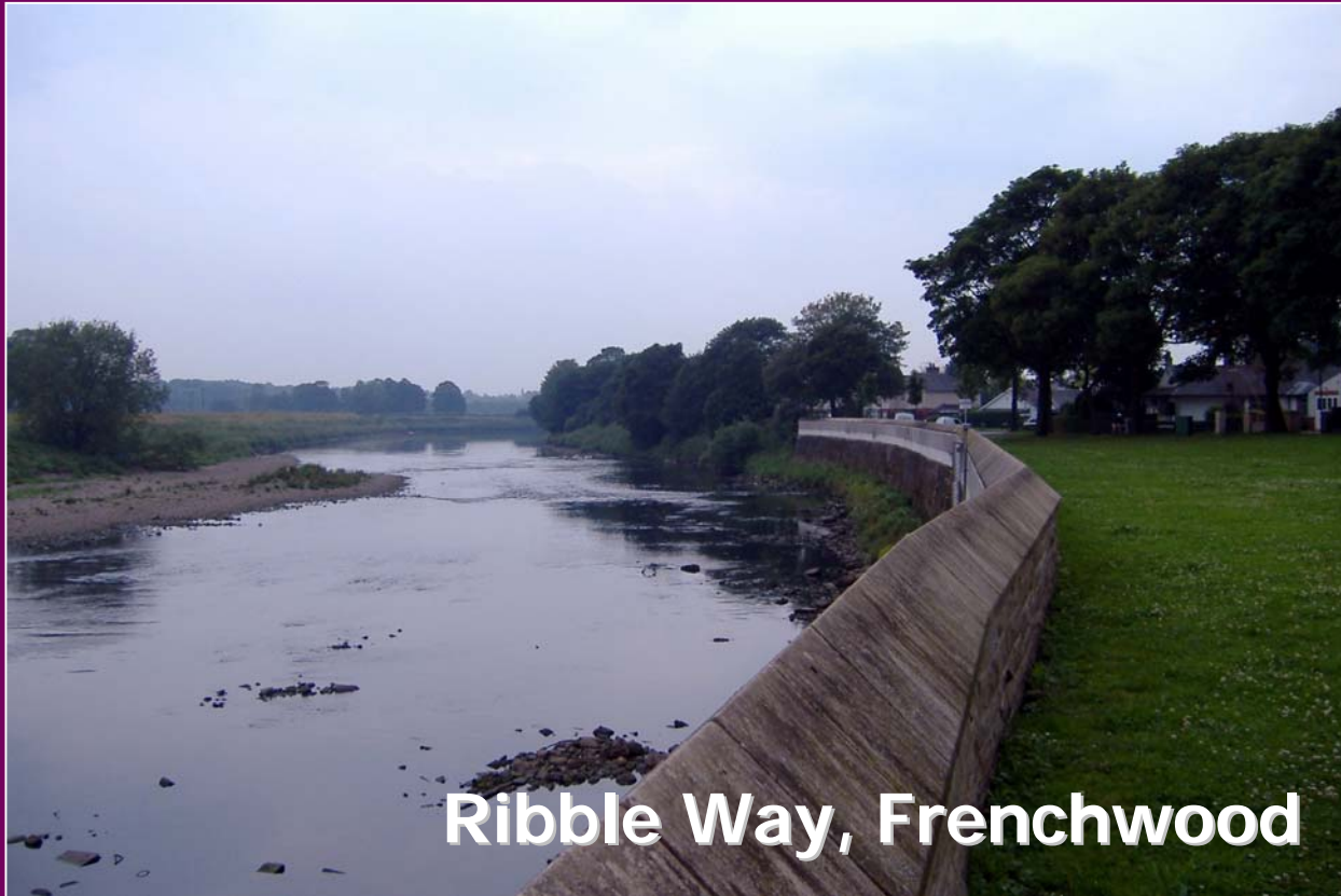
Ribble Way, Frenchwood