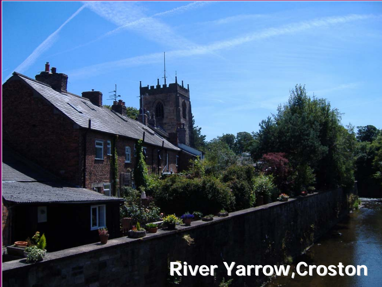
River Yarrow, Croston