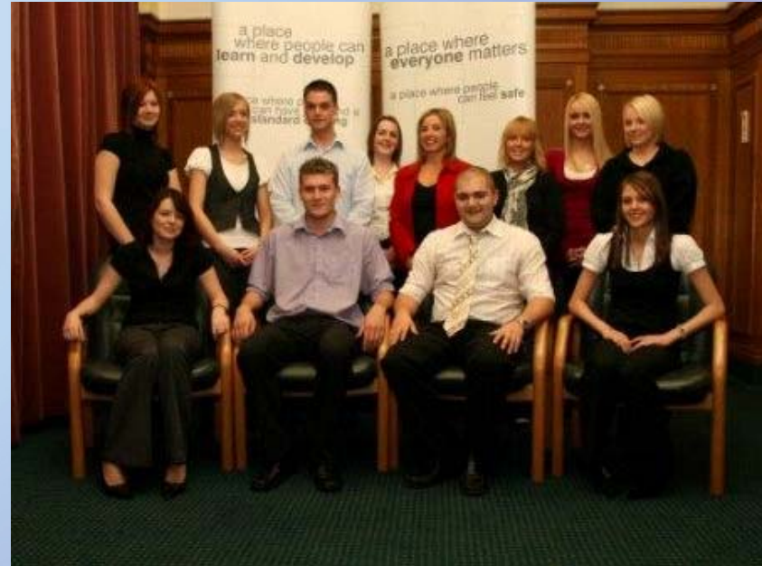
Apprentice Certificate Presentation for those who passed their NVQ Level 2 and 3 in Business Administration